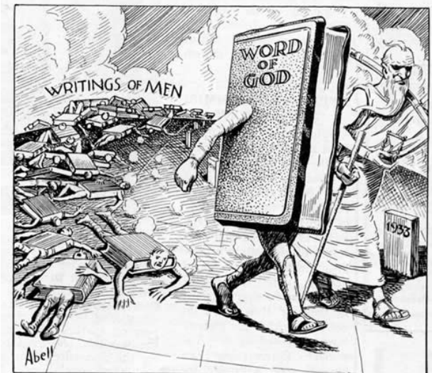
The Word of God shall stand forever—Isaiah 40:8

That Book, which was the best inheritance you ever received from your ancestry, and which will be the best legacy you will leave to your children when you bid them goodbye as you cross the ferry to the Golden City. ■