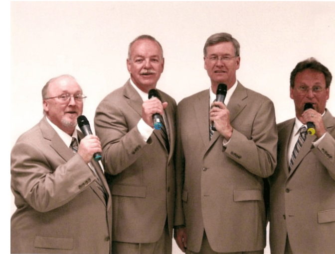
from Graceway Baptist Church of Oklahoma City