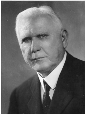
Dr. George W. Truett Pastor - First Baptist Dallas 1897-1944