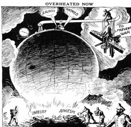
How long will it hold?