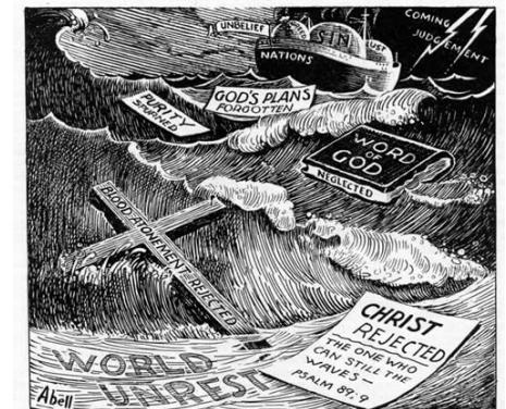
"And upon the earth distress of nations, with perplexity; the sea and the waves roaring." (Luke 21:25)