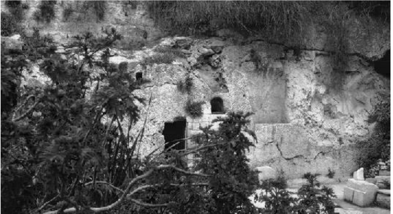
Burial Tomb Thought Most Likely To Be Used For Our Lord Jesus Christ

“And the angel answered and said unto the women, Fear not ye: for I know that ye seek Jesus, which was crucified. He is not here: for he is risen, as he said. Come, see the place where the Lord lay” (Matthew 28:5-6).