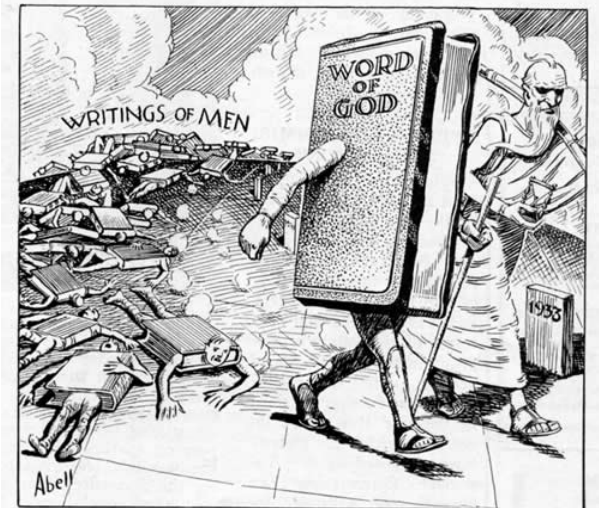
The Word of God shall stand forever—Isaiah 40:8

There is one thing that encourages me very much and that is that the Lord made out to manage the universe before they were born, and will probably be able to make out to manage the universe a little while after they are dead. While I demand that the antagonists of the Bible and the critics of the Bible go clear over where they belong, on the Devil's side, I ask all the friends of this good Book to come out openly and aboveboard in behalf of it. That Book, which was the best inheritance you ever received from your ancestry, and which will be the best legacy you will leave to your children when you bid them goodbye as you cross the ferry to the Golden City.