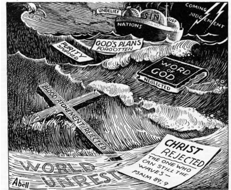
“And upon the earth distress of nations, with perplexity; the sea and the waves roaring.” (Luke 21:25)