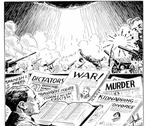
The outlook and the uplook (Luke 21: 28)