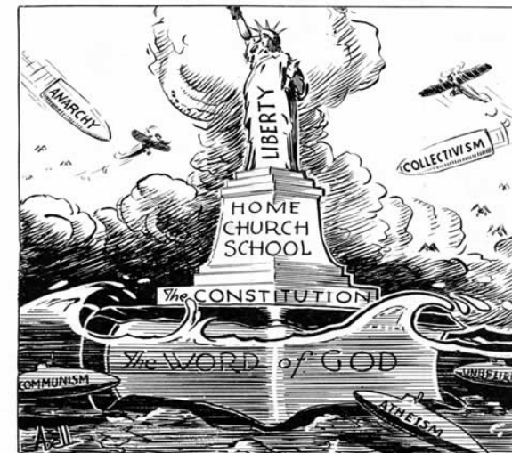
“The foundation of God standeth sure”—Timothy 2:19