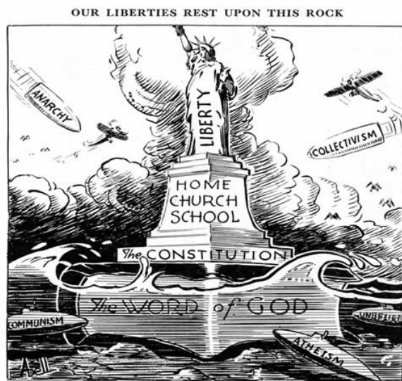
“The foundation of God standeth sure”—Timothy 2:19

John Hancock, a very wealthy individual lived in a mansion reflecting his princely fortune – one of the largest in the Province of Massachusetts. During the time the American army besieged Boston to rid it of the British, the American officers proposed the entire destruction of the city. “By the execution of such a plan, the whole fortune of Mr. Hancock would have been sacrificed. Yet he readily acceded to the measure, declaring his willingness