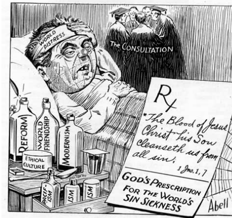
The Neglected Remedy