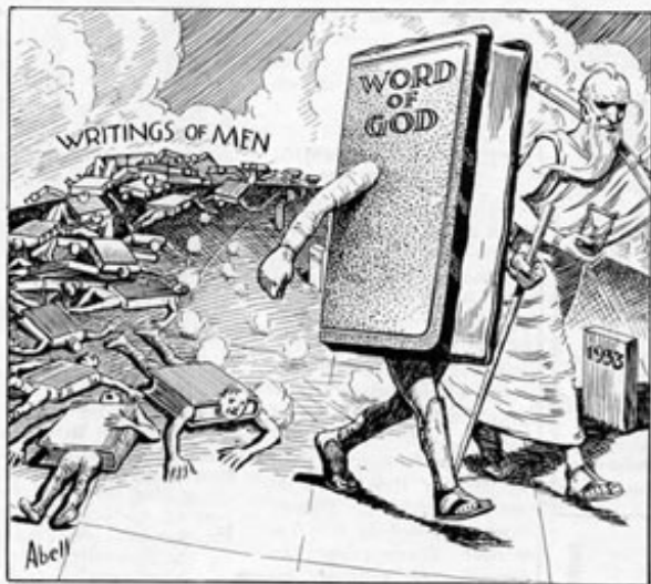
The Word of God shall stand forever—Isaiah 40:8

Blessed Book, precious book, On thy dear old tear stained leaves I love to look; Thou art sweeter day by day, As I walk the narrow way That leads at last to that bright home above.