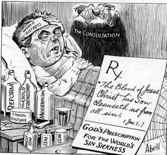
The Neglected Remedy