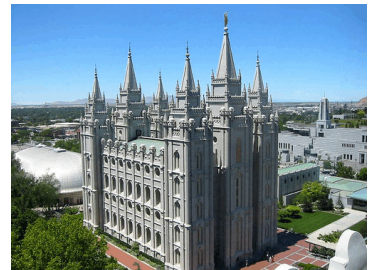
LDS Temple In Salt Lake City, Utah