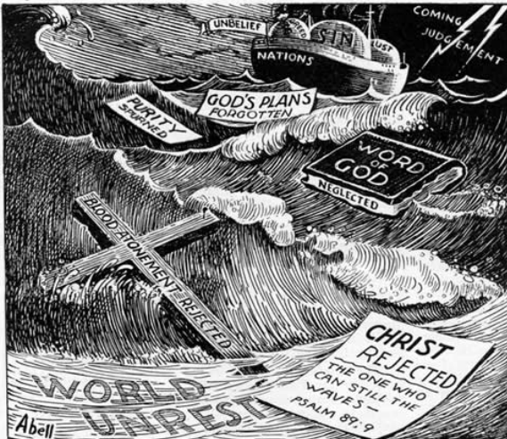
"And upon the earth distress of nations, with perplexity; the sea and the waves roaring." (Luke 21:25)