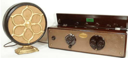
1928 Atwater Kent