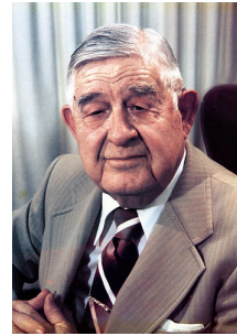
Dr. John R. Rice 1895 - 1980