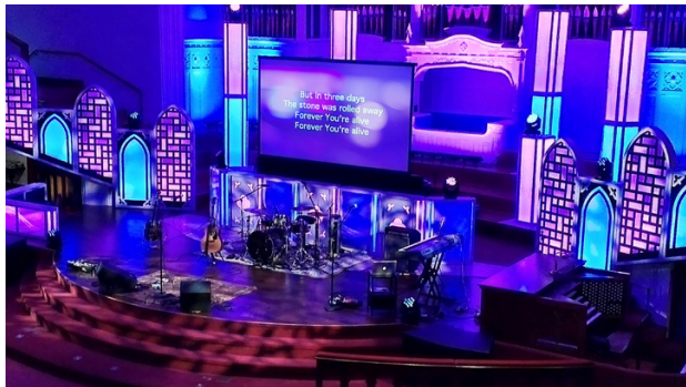
First Baptist Dallas' 1891 Sanctuary, after

12. HYMNALS CONFRONT US WITH "NEW" SONGS. We tend to go back to our favorite songs too often. It's easy to fall into a rut. I recently looked back at a year's worth of bulletins, and was a little embarrassed at how much we had sung several hymns. Not that there was anything wrong with the hymns, but the congregation needs to be stretched to learn unfamiliar songs. When I was a kid, I enjoyed learning to play my favorite hymns on the piano from my mom's 1975 Baptist Hymnal. Along the way, I would run into hymns that weren't my favorites. After a while, while flipping through the book, I would run into these hymns again and again. Finally, I would stop and take a look.