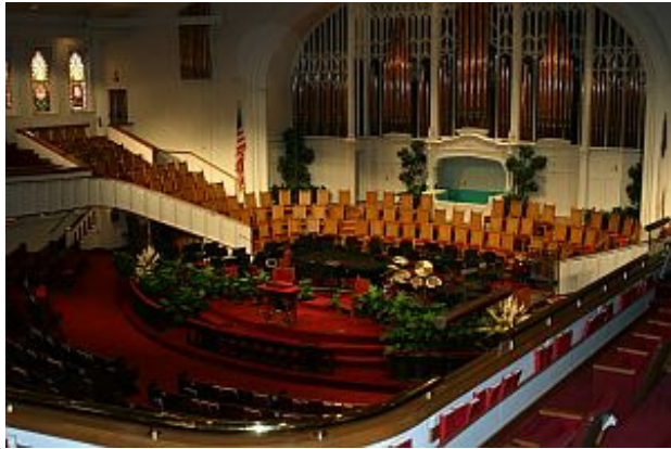
First Baptist Dallas' 1891 Sanctuary, before

Here is a particularly painful before and after example from the First Baptist Church in Dallas, Texas -