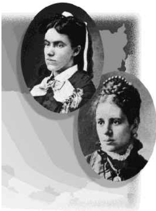
Lottie Moon & Annie Armstrong