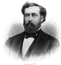
Philip P. Bliss (1838-1876)