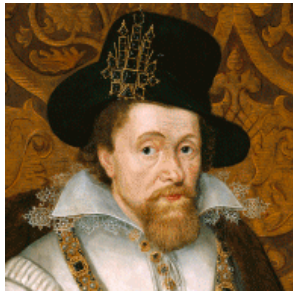
King James I 1566 -1625