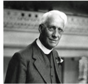
G. Campbell Morgan 1863-1945