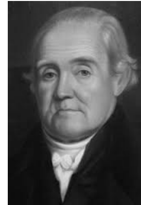
Noah Webster - 1833