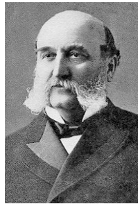
Ira D. Sankey 1840-1908

What kind of world would the Western world have been had Protestantism become its master? Who but the Baptist kept Protestantism from becoming master? The general attitude today is that the truth is determined by the passing of time; that there aren't eternal, abiding truths. “You can't turn the clock back. Time invalidates all truth. Time invalidates one set of truth and fastens another set upon us.” Baptist history repudiates this philosophy of fatalism. Baptists today are believing, teaching, preaching, and practicing the truths that they believed, taught, preached, and practiced two thousand years ago. It gives me a feeling of stability to reflect that I, as a Baptist, am in the stream of this long continuity of faith and practice. The Baptist people are a great continuity...a great essence...a great dignity. The world never needed them more than it needs them today. ■