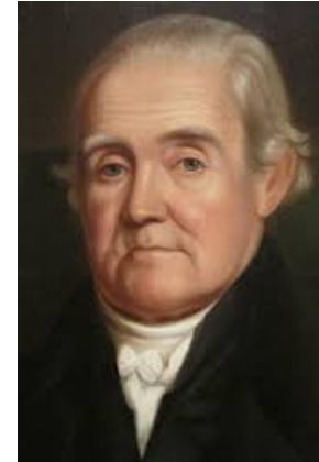
Noah Webster - 1833

B iblical salvation is a conversion experience that changes the life (John 3:3; Mat. 18:3; II Cor. 5:17). Every salvation recorded in the New Testament involves a life-changing conversion experience (e.g., the woman at the well, Zacchaeus, the Jews on day of Pentecost, the Ethiopian eunuch, Lydia, the Philippian jailer).