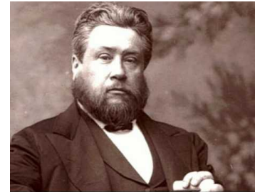
Charles Haddon Spurgeon, Pastor Metropolitan Tabernacle, London b. 1834, d. 1892