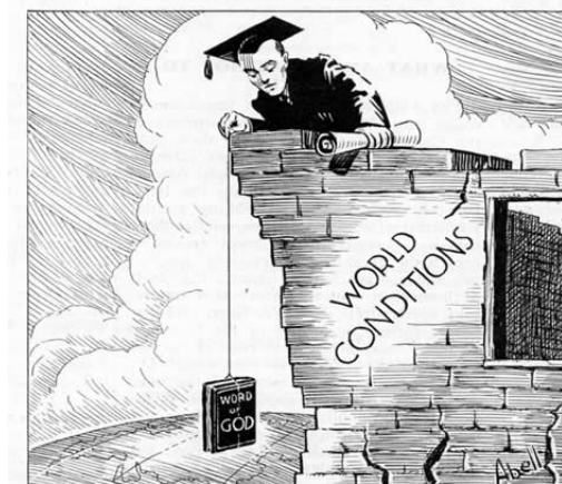
Judgment also will I lay to the line, and righteousness to the plummet.—Isaiah 28:17