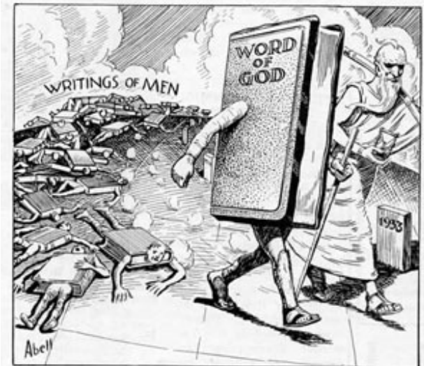
The Word of God shall stand forever—Isaiah 40:8