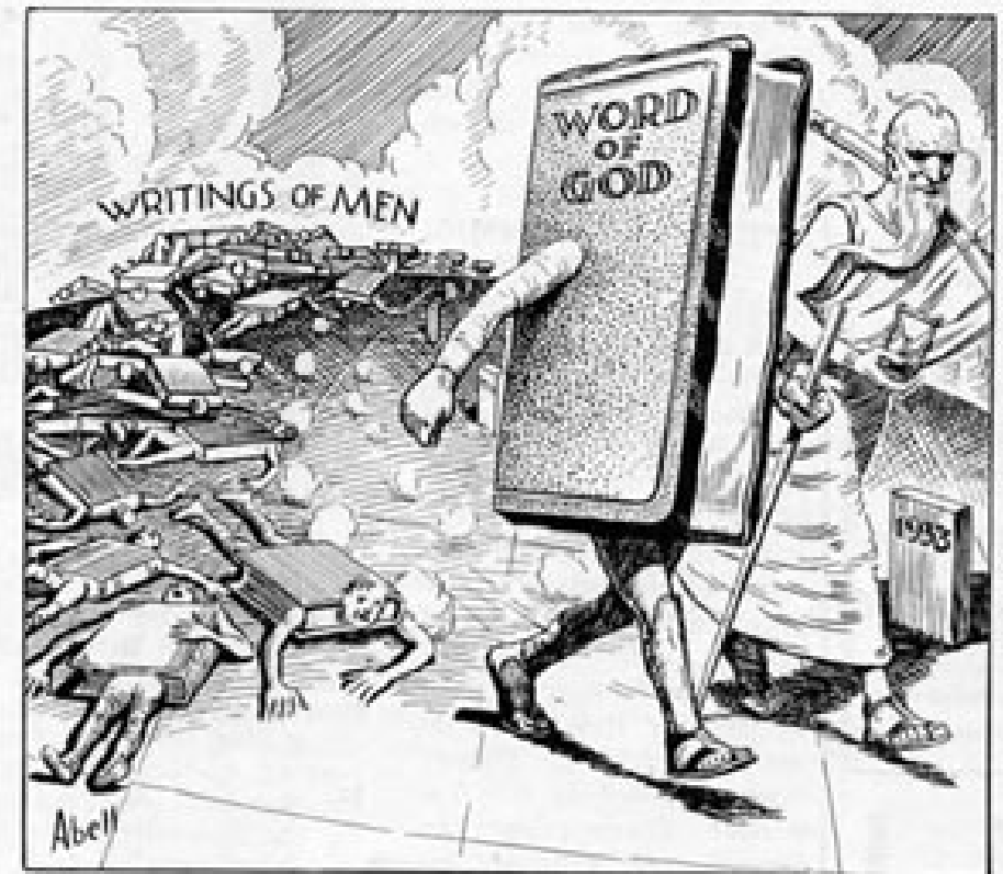
The Word of God shall stand forever—Isaiah 40:8