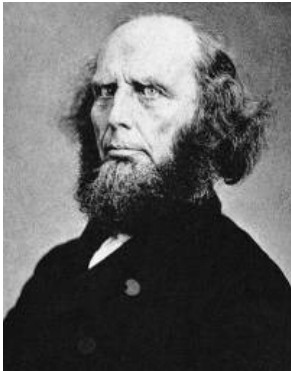
Charles G. Finney 1792 - 1875