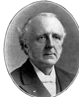
F. B. Meyer (1847-1929)