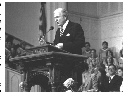
Dr. W. A. Criswell