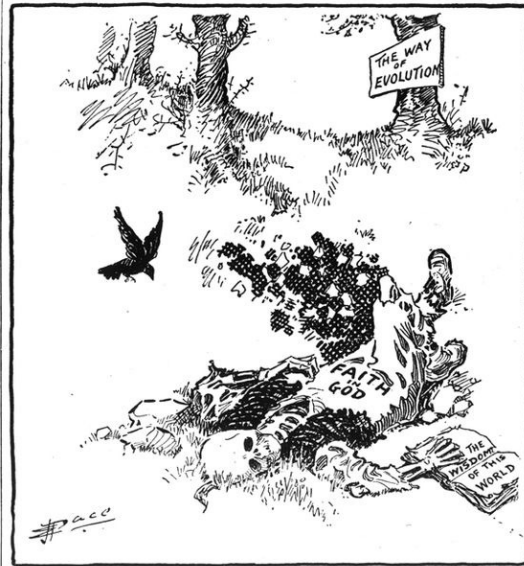
THE END OF THE ROAD!