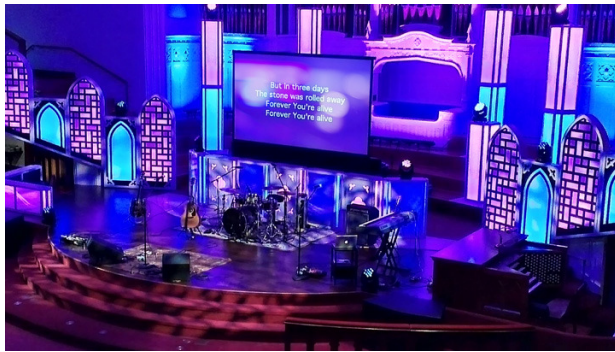
First Baptist Dallas' 1891 Sanctuary, after

12. HYMNALS CONFRONT US WITH "NEW" SONGS. We tend to go back to our favorite songs too often. It's easy to fall into a rut. I recently looked back at a year's worth of bulletins, and was a little embarrassed at how much we had sung several hymns. Not that there was anything wrong with the hymns, but the congregation needs to be stretched to learn unfamiliar songs. When I was a kid, I enjoyed learning to play my favorite hymns on the piano from my mom's 1975 Baptist Hymnal. Along the way, I would run into hymns that weren't my favorites. After a while, while flipping through the book, I would run into these hymns again and again. Finally, I would stop and take a look. Often, these "new" hymns turned out to be great sources of