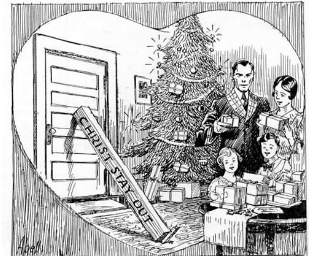
Behold, I stand at the door, and knock.—Revelation 3:20