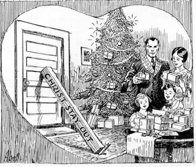
Behold, I stand at the door, and knock .- Revelation 3:20