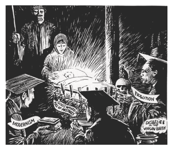
"Professing themselves to be wise, they became fools" -Romans 1:22